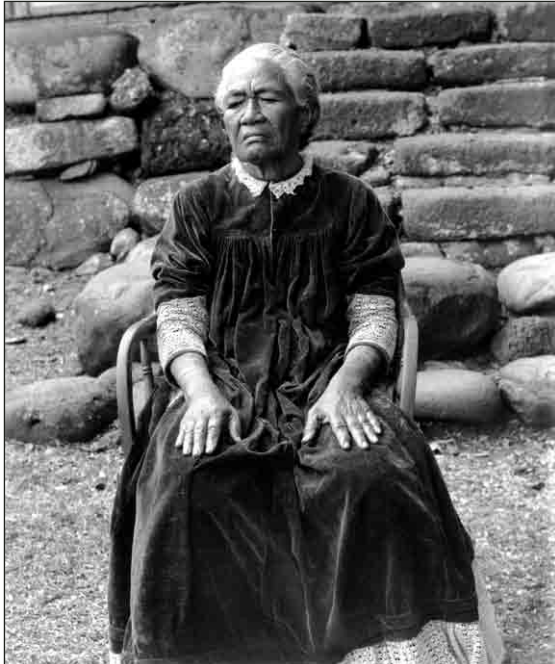
Figure 1. Vaekehu, Queen of the Marquesas. Neg. no. 121424.