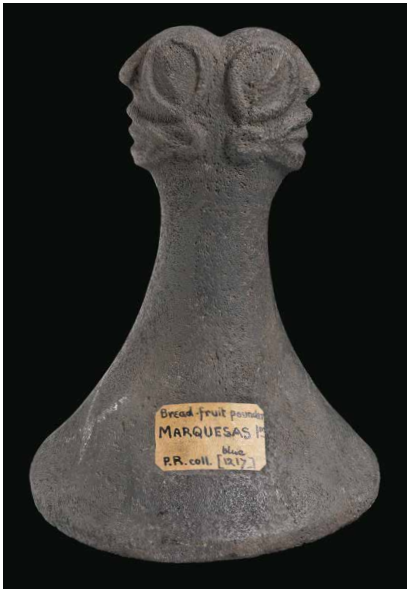
Figure 2. ( adjacent ) Another view of the ke'a tuki popoi illustrated in Figure 1. (It is not known who marked the ke'a tuki popoi with a white cross, nor when, nor why.)