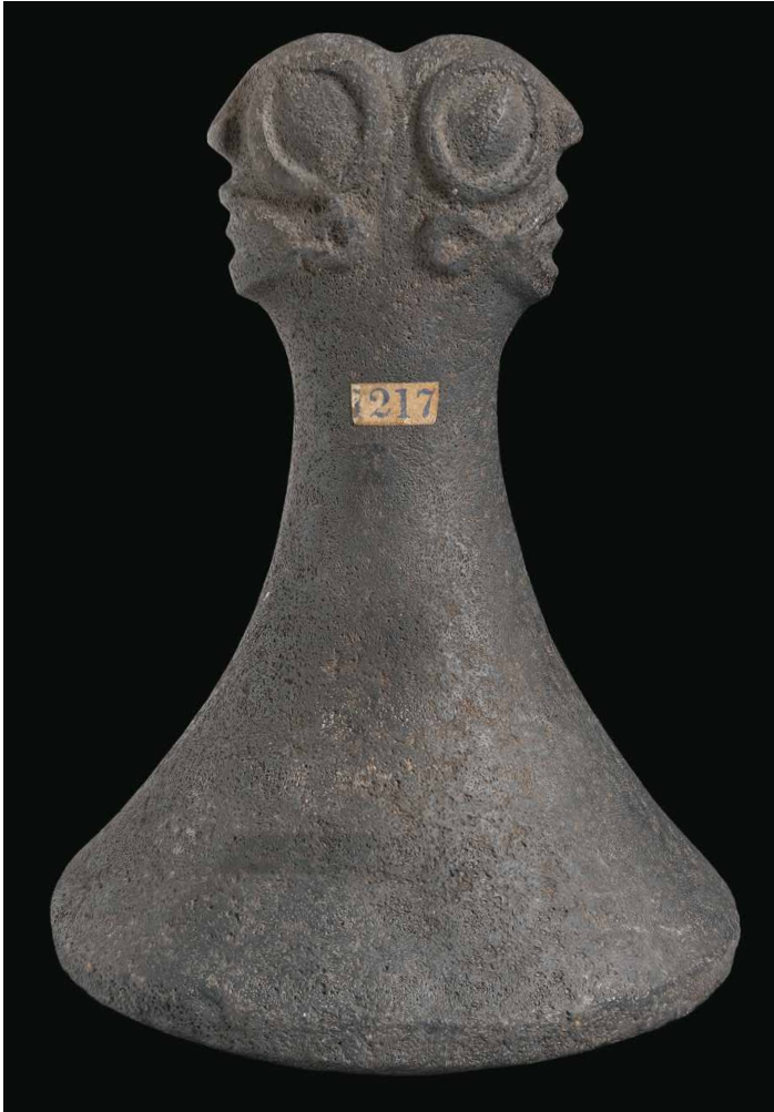
Figure 1. Marquesan food pounder, ke'a tuki popoi ; stone; 140 mm high, 105 mm in diameter (maximum), 310 in circumference (maximum), 90 mm in circumference (minimum); 797 gm; acquired by Augustus Henry Lane Fox (later Pitt-Rivers) by 25 January 1870; part of the founding collection of the Pitt Rivers Museum, University of Oxford (1884.128.78).