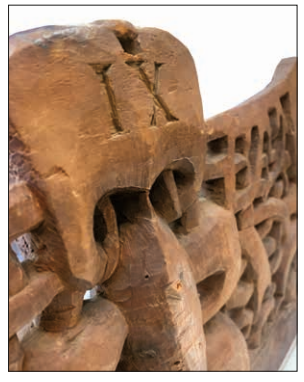
Figure 11. Pare "IX" (Kendall no. 9) front (above) and back showing Roman numeral (left). Brooklyn Museum, New York, 61.126.