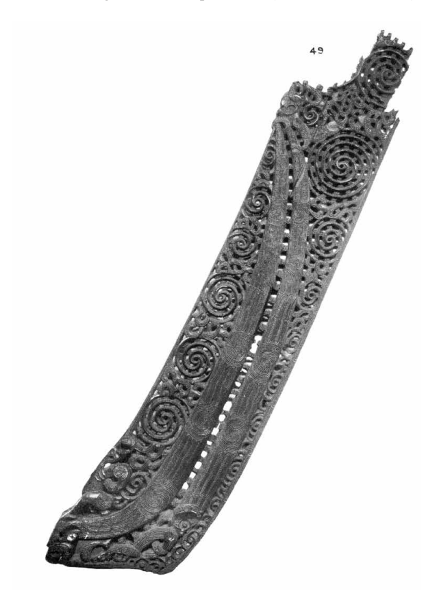
Figure 12. Taurapa thought to be Kendall no. 10 as illustrated in the Oldman catalogue (plate 49). Current location not known but possibly in New Zealand.

No. 11 Another Stern, or feet of a War Canoe & sent in order to shew the Society the Uniformity of the design of the natives in respect to the signification of the figures cut out upon them. (Kendall 3 June 1823)