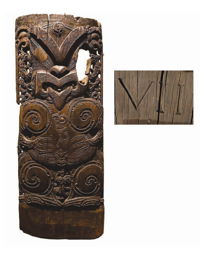
Figure 5. Poupou (wall carving, left) "VII" (Kendall no. 7) and detail (right) of Roman numeral from back, Ethnologisches Museum, Berlin, VI 31790.

one, that pervade Kendall's writings on the taonga and Māori spirituality, calling this out as "completing for himself the Christian Godhead" (p. 145). The figure "suspended from the breast" is a manaia (beaked character in profile) on the Berlin poupou and not a serpent—with all of its biblical allusions—described by Kendall. On either side of the main figure's head are female manaia and between the main figure's legs is a female tiki (carved figure in an abstract form of a human). A wrought-iron screw is fixed to the back of the poupou. It may be a remnant of the fixings Kendall used for his "cards", since such screws were produced in the mission's blacksmith workshop at Rangihoua (Smith 2019: 118).<sup>11</sup>