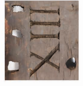
Figure 8. Paepae pātaka "XIII" (Kendall no. 13) front (above) and detail (left) of Roman numeral from back, Ethnologisches Museum, Berlin, VI 31791 and VI 31792.