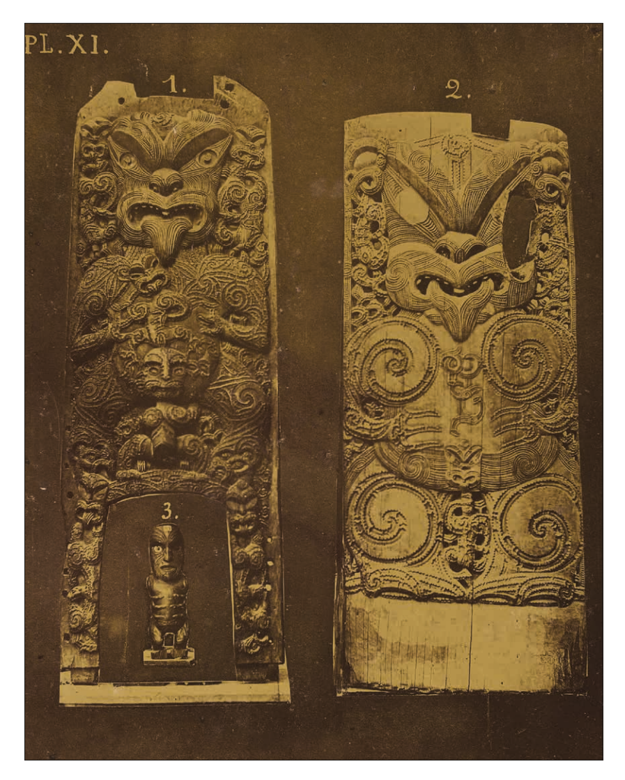
Figure 2. Kūwaha pātaka (no. 1), poupou (no. 2) and tekoteko (no. 3) from the CMS collection illustrated as plate XI in the Musée des missions évangéliques: Exposition universelle, Paris, 1867 catalogue. Getty Research Institute, Los Angeles (93.R.102).