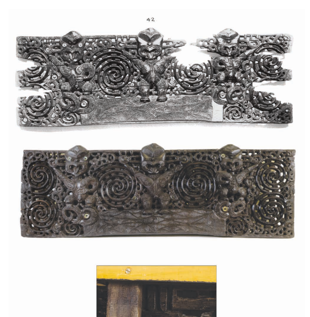
Figure 10. Pare "VIII" (Kendall no. 8) as illustrated in the Oldman catalogue (plate 42; top); in repaired condition (middle) and detail of Roman numeral (bottom), Canterbury Museum, Christchurch, E150.594A.