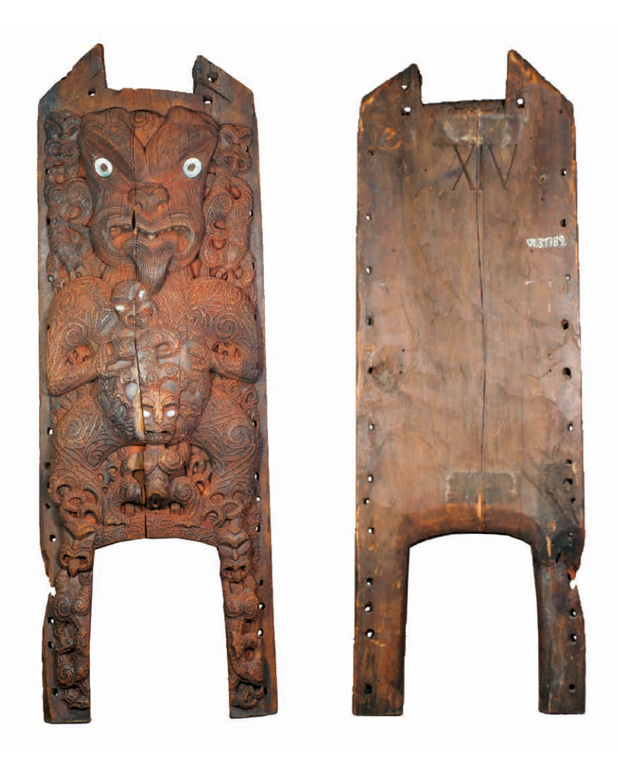
Figure 6. Kūwaha pātaka "XIV" (Kendall no. 14) front view (left) and back view (right) showing Roman numeral at top, Ethnologisches Museum, Berlin, VI 31789.