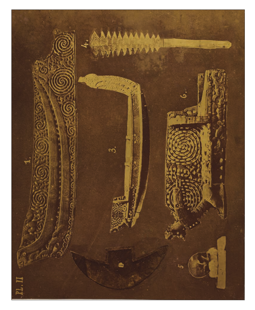
Figure 1. Taurapa (no. 1), model waka taua (no. 3) and tauihu (no. 6) from the CMS collection illustrated as plate II in the Musée des missions évangéliques: Exposition universelle , Paris, 1867 catalogue. Getty Research Institute, Los Angeles (93.R.102).